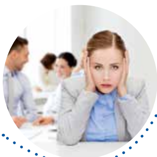
5 ACOUSTICS IN OPEN-PLAN OFFICES