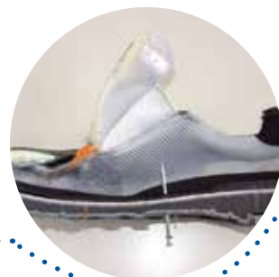
6 SAFETY FOOTWEAR