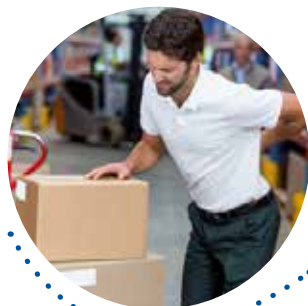
3 MANUAL LOAD HANDLING