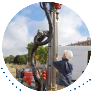
1 DRILLING AND FOUNDATION EQUIPMENT

This document illustrates with six examples how certain standards, to which the Occupational Injuries and Diseases Branch has contributed, can improve occupational health and safety at work.