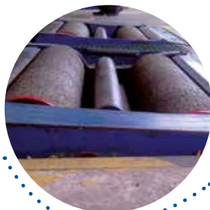
4 ROLLER BRAKE TESTERS